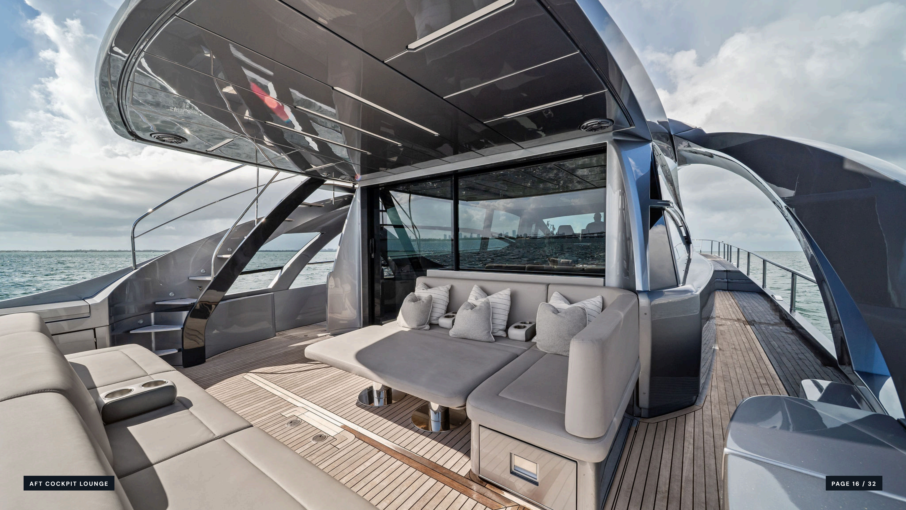
AFT COCKPIT LOUNGE